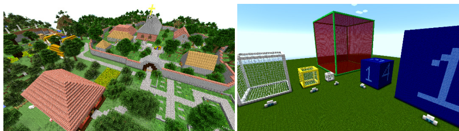
Figure 2: In the history curriculum (left), the students built iconic structures and rudimentary societies from the Medieval Ages (like a monastery and adjoining farms, as pictured). In the mathematics curriculum (right), the students calculated scale ratios, drew blueprints, and built simple geometric objects and scale models of real-world objects (like the large die on the right side).

The two different classes also worked within different subject matters, as the 7 th grade class worked with mathematics and geometry, and the 5 th grade class worked with medieval history. This informed the structure of the activities the two classes participated in. The purpose of the game-based learning activities with the 7 th graders was to let them experiment with length, area, and volumetric scaling in a three-dimensional environment. For the 5 th graders, the game-based activities revolved around the research, re-creation, and re-enactment of iconic structures and communities from a specific historical time period (the Middle Ages). As such, the mathematic gaming curriculum focused on heightening students' understanding of geometrical objects and calculations by letting them manipulate and construct those objects first-hand, and the historical curriculum focused on letting students experience and reflect on the taught subject matter through re-creation and re-enactment. Figure 2 shows a snapshot of how these lessons were manifested in the game environment.